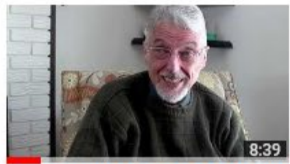
Stay Savvy Vermont - "She's Alive II" 8:39