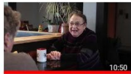
Stay Savvy Vermont - "Perfect Fit" 10:50