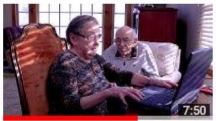
Stay Savvy Vermont - "Internet Follies" 7:50