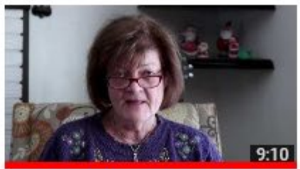
Stay Savvy Vermont - "Out! Out! Damned Peddler" 9:10