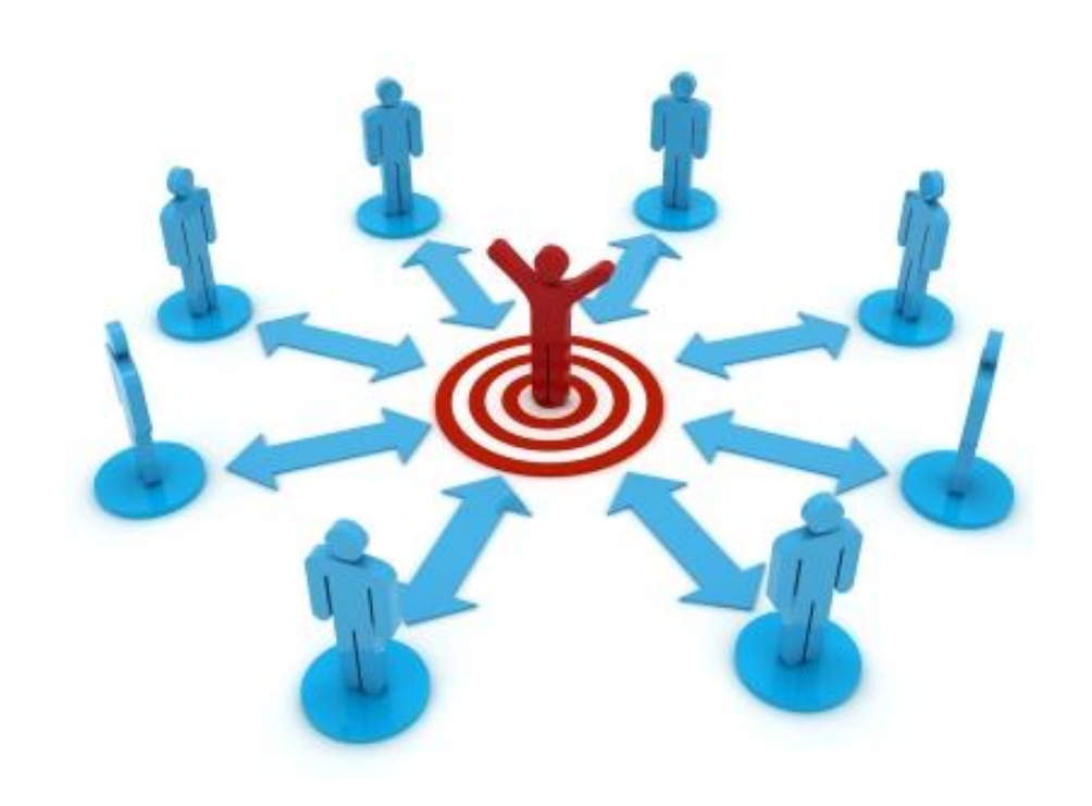
A Guide for People with Disabilities and their Families